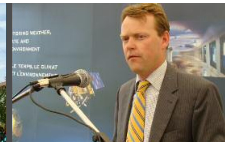
Mr Christophe KAMP, European Union delegation to the African Union

The project is the first concrete action in the field of environment within the framework of the Africa-European Union strategic partnership on climate change.