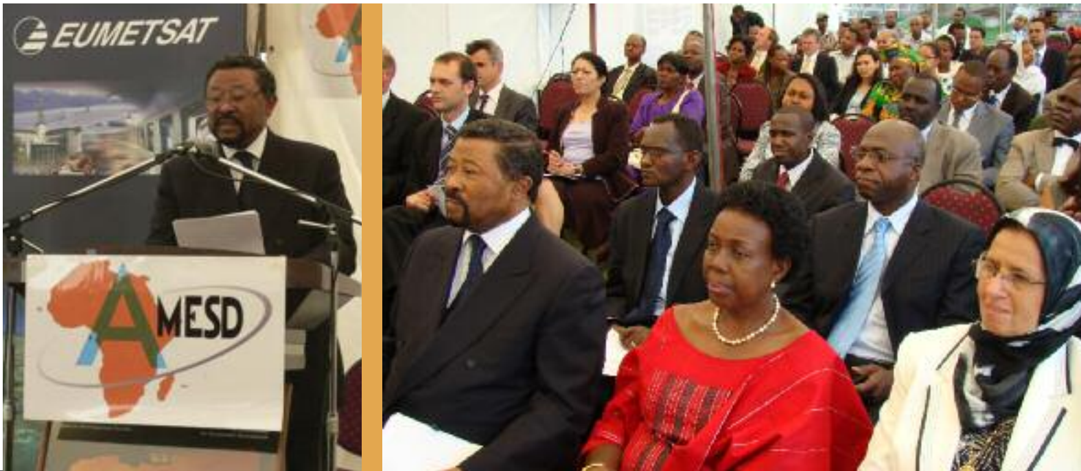
Jean PING, President of the Commission of the African Union