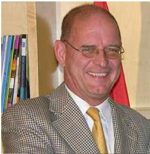
Dutch Ambassador Alphons Hennekens

effort to curb piracy in the waters around Somalia. Since my arrival in Ethiopia, I have visited Djibouti more than 10 times, not only for bilateral discussions. A number of visits were triggered by the presence of Dutch warships in Djibouti which were/are deployed in the region to secure maritime lanes from the subcontinent to the strait of Bab el Mandeb. Securing these lanes is of utmost importance to the economies of Europe and other countries. The strategic position of Africa in this context is obvious.