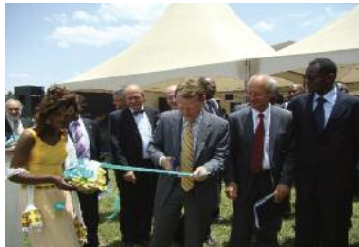
Inauguration