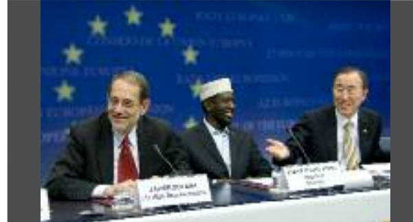
EU HR Javier Solana with Somali President Sheikh Sharif and UNSG Ban ki Moon at the Brussels conference

In a letter addressed last 28 May to all ministers for Foreign Affairs and all Ministers of defense of the EU, the High representative Javier Solana suggests to "build on the success of the EU naval operation Atalanta" and to "look at longer term durable solutions for stability in Somalia and the region - both at sea and on land".