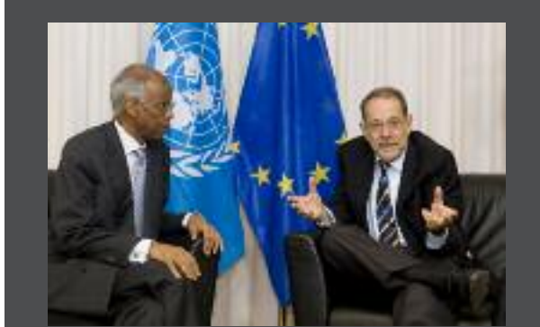
EU HR Javier Solana with UNSRSG for Somalia, Ahmedou Ould Abdallah