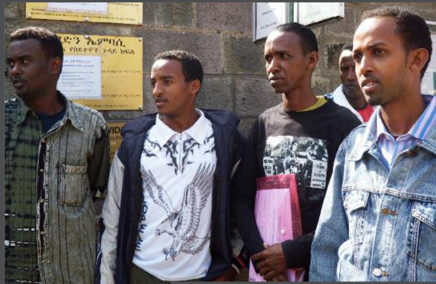
Each year, 6500 Somalis request a residence permit at the Swedish embassy in Addis

As a teenager, I lived in Kenya for four years and have always wanted to come back to Africa. I returned four years ago, when I set up the Swedish Embassy in Sudan. Then, as a Special Envoy Ambassador, I worked for two