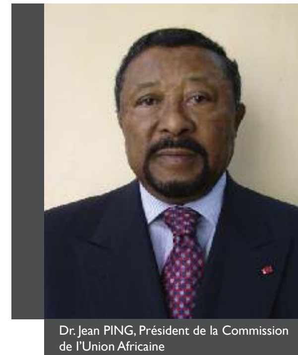
Dr. Jean PING, Président de la Commission de l'Union Africaine

J. Ping : Vous n'êtes pas sans savoir que le thème de ce 13ème Sommet de l'Union africaine est «Investir dans l'agriculture pour la croissance économique et la sécurité alimentaire ». Ce thème est très vaste et nous rappelle plusieurs défis et autant d'enjeux. J'entends par là, le défi de la disponibilité financière et l'ensemble des infrastructures qui feront de l'Afrique un continent dont l'autosuffisance alimentaire ne fera plus l'ombre d'un doute. Ces dernières années dans plusieurs pays africains, la crise alimentaire et financière a poussé dans la rue des milliers de