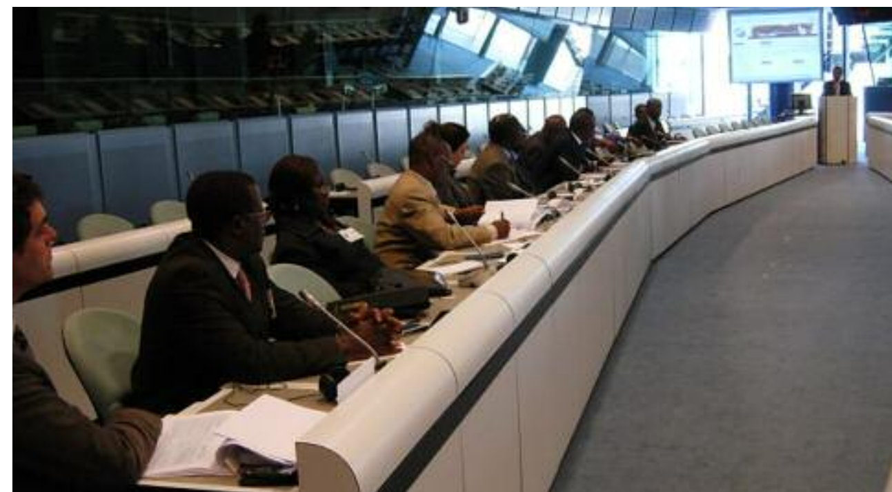
Pan-African delegation in Brussels

Two pan-African delegations have visited Europe from 1 to 8 June, to attend a seminar on election observation and to attend the election of members of the European Parliament (EP).