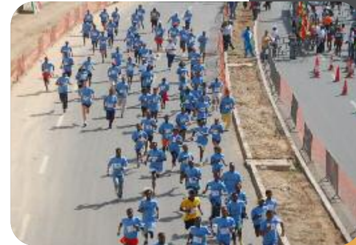
Start of the the run

Lord Kinnock is a former Labour party leader (1983-1992), former European Commissioner for Transport 1995-1999 and 1999-2004) and former Vice-President of the Commission. Lord Kinnock has substantial experience gained through reforming the Labour Party when he was party leader and leader of the opposition and later as Vice President of the European Union when he implemented a significant EU reform Agenda. He has been President of Cardiff University since 1998 and Chair of the British Council, the United Kingdom’s international organisation for cultural and educational relations, since December 2004.