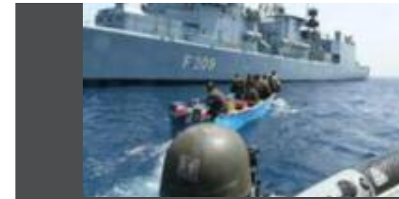
EU NAVFOR-ATALANTA Mission in action

Since 8 December 2008 the European Union has been conducting a military operation, named EU NAVFOR Somalia-Operation ATALANTA to help deter, prevent and repress acts of piracy and armed robbery off the coast of Somalis. This operation – the European Union's first ever naval operation - is being conducted in the framework of the European Security and Defense Policy (ESDP).