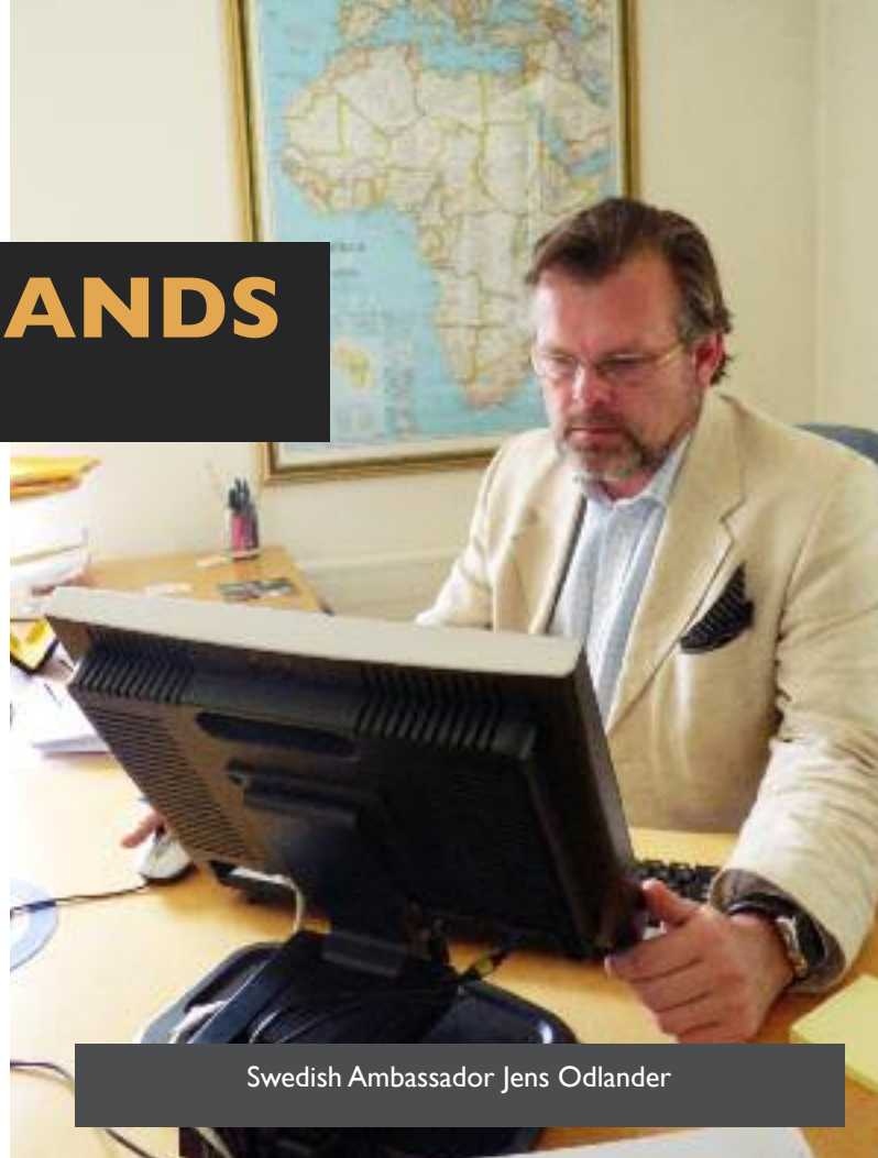
Swedish Ambassador Jens Odlander

As for the global challenges, I see two main priorities. First the preparation of the Copenhagen summit on climate change in December 2009. I foresee that we will try to negotiate a common position between the European Union and Africa. We will negotiate with Asia, the USA and China to prevent warming and climate change as much as possible. Second, we will have to coordinate a continued response to the